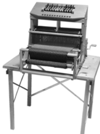
Voyageur 12s 15 3 / 4 " on a Dorothy table