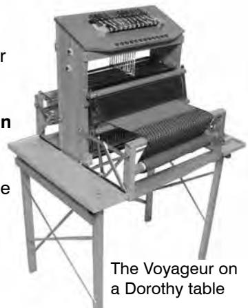
The Voyageur on a Dorothy table

(2120-0916) $75. The Beaters can be interchanged in a few minutes.