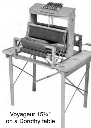
Voyageur 15¾" on a Dorothy table

2120-0009 9½" $885.00 2120-0016 15¾" $885.00