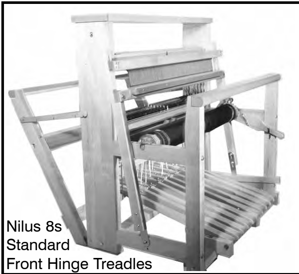
Nilus 8s Standard Front Hinge Treadles