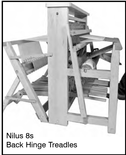
Nilus 8s Back Hinge Treadles