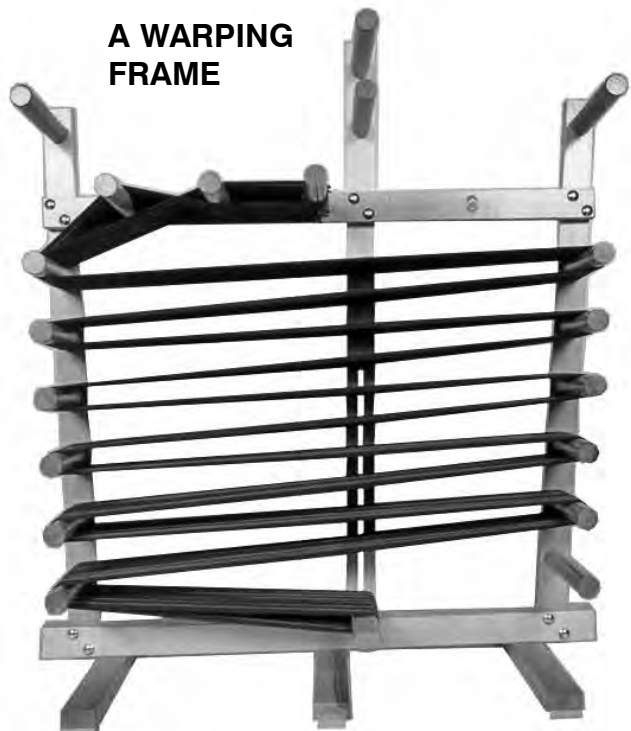
A WARPING FRAME

A floor standing INKLE Loom, to weave strips of fabric up to 6" wide and 16 feet long. Designed for continuous string heddles which are made in minutes. The heddle length is adjustable by turning the heddle carrier.