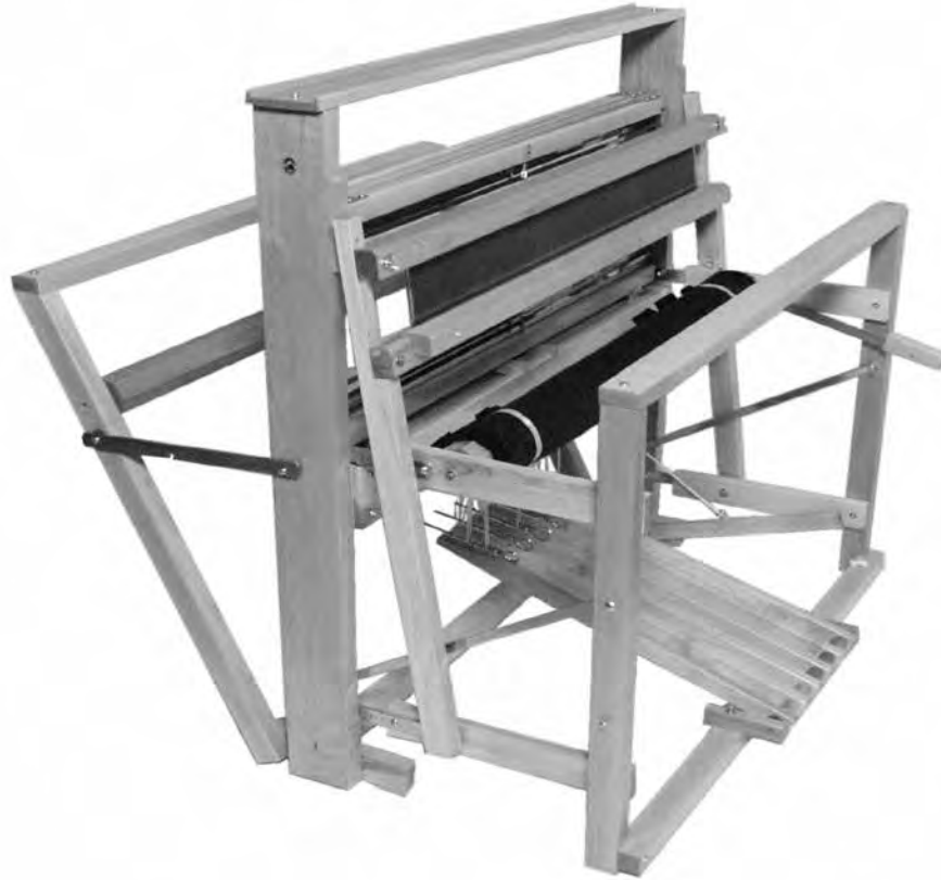
Jack-Type 4 Shaft

1009-0000 Jack-Type 4 Shaft Loom $1950.00 1009-0008 Jack-Type 8 Shaft Loom $2505.00